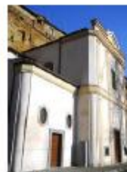
Alta Scuola Headquarters