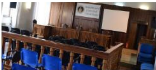
Centro Studi Orvieto Large Meeting Room