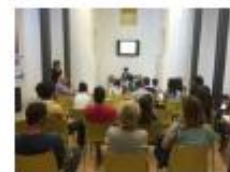
Alta Scuola Meeting Room